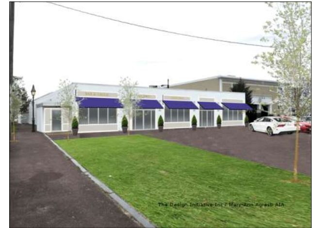
Architect's Renderings of possible changes in building facade

For more information about this opportunity contact: