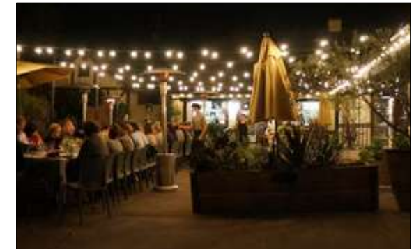
Extensive patio area with potential for possible outdoor seating

For more information about this opportunity contact: