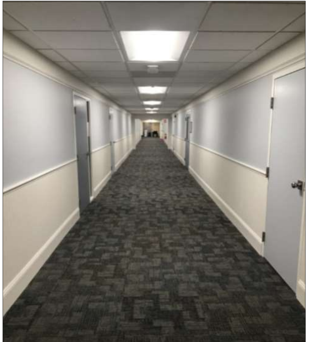
Wide, Spacious Hallways