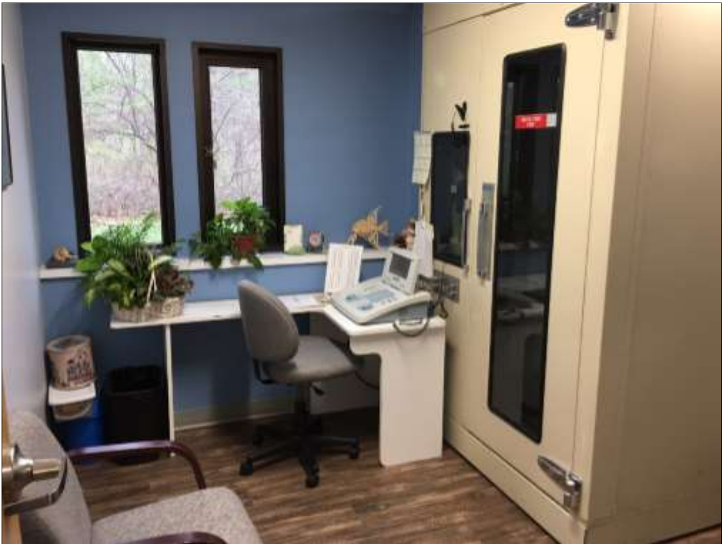
A building designed by Doctors, for Doctors