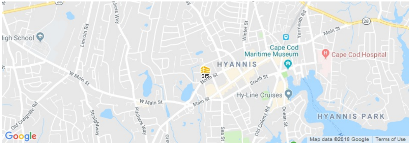
Legend: 🏠 Subject Property