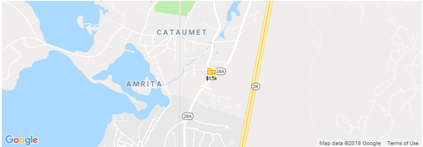
Legend: 🏠 Subject Property